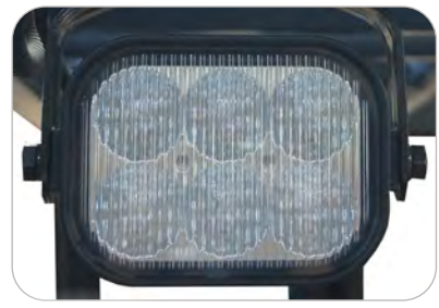
LED Lights Brighter and longer-lasting than traditional sealed beams or halogen lights.