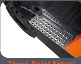
Three-Point Entry/ Exit System