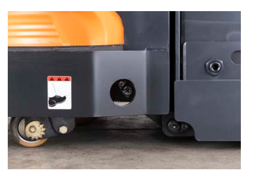
Maintenance Friendly Grease zerks at all pivot points make servicing easy and convenient, increasing up-time