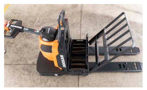
Battery Roller System is Standard Saves time and effort during battery change-outs