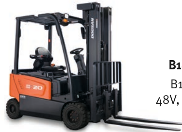
B18X-7 Series B16/18/20X-7 48V, 4 Wheel truck