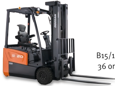
B18T-7 Series B15/18/20T-7, B18/20TL-7 36 or 48V 3 Wheel Truck